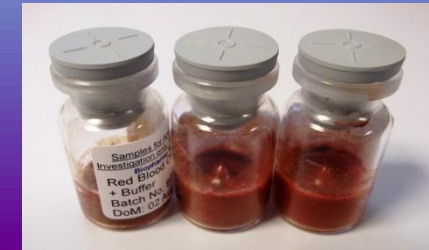
Figure 2 – Vials of freeze dried blood